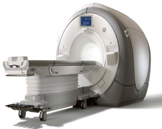
Fig. 2: A typical MRI magnet, in this case a GE 3 Tesla MR750™.

There is only one very large commercial power application of superconductors at present: magnetic resonance imaging (MRI [24]) (see Fig. 2). With thousands of units in hospitals world wide and global sales of several billion US dollars per year, this is truly a major product. The superconducting portion consists of a “basic” solenoid, which creates the background magnetic field required for nuclear magnetic resonance (NMR) of nuclei (almost always protons) in biological systems (chiefly humans). The superconductor employed is almost always NbTi. Fig. 3 gives some typical specifications that may be required for NbTi used for MRI.