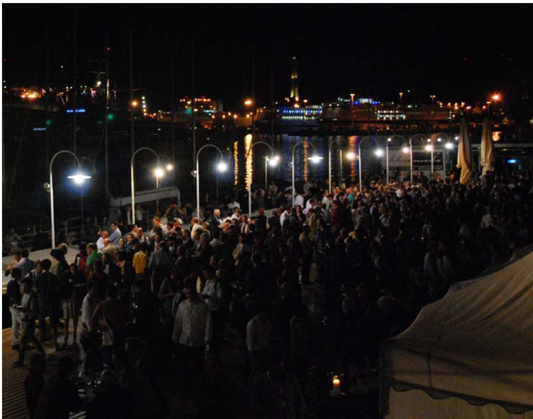
Photo 5. Conference dinner on the patio of the Aquarium of Genoa in the “Porto Antico” (Old Harbor), September 17, 2013.