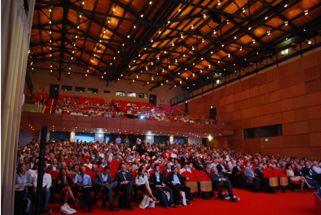
Photo 2. Audience at the 1 st plenary session.