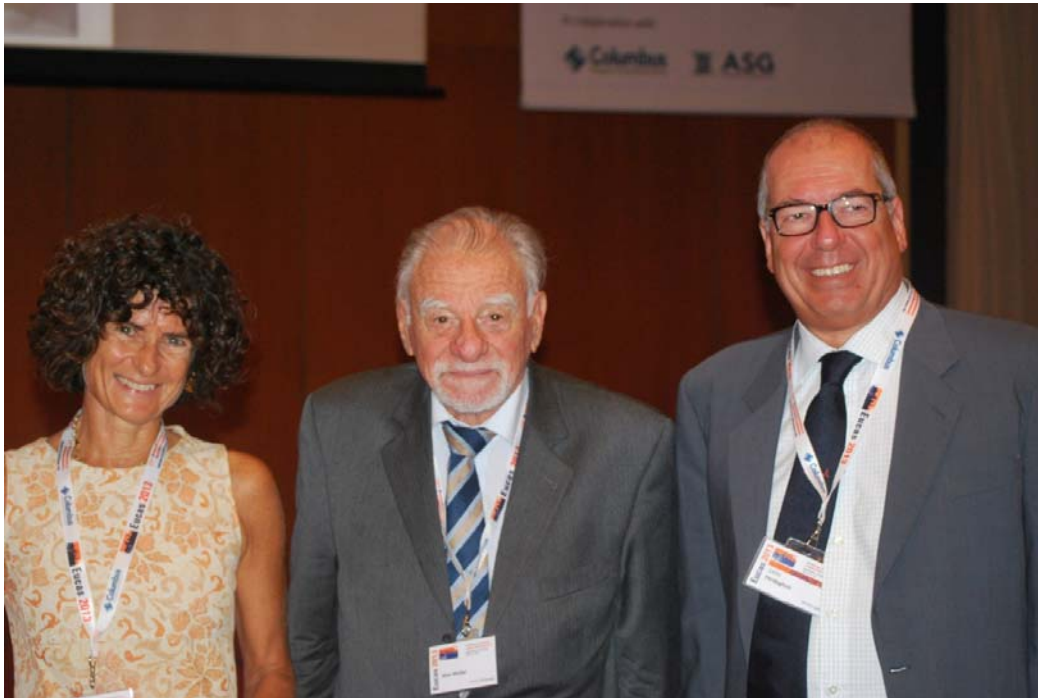
Photo 4. Conference Chairs with the Nobel Laureate, Prof. Alex Müller.