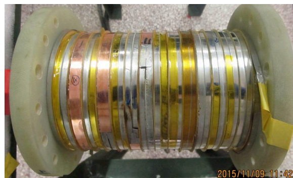
Fig.2. ReBCO insert in assembly