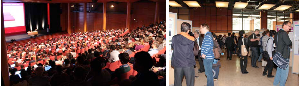
Plenary presentation in Lumière auditorium and poster session during EUCAS 2015

From left to right: the ESAS Award ( PA29 ), IEEE Award ( PA31 ) and ESAS Young Researcher Prize ( PA30 ).