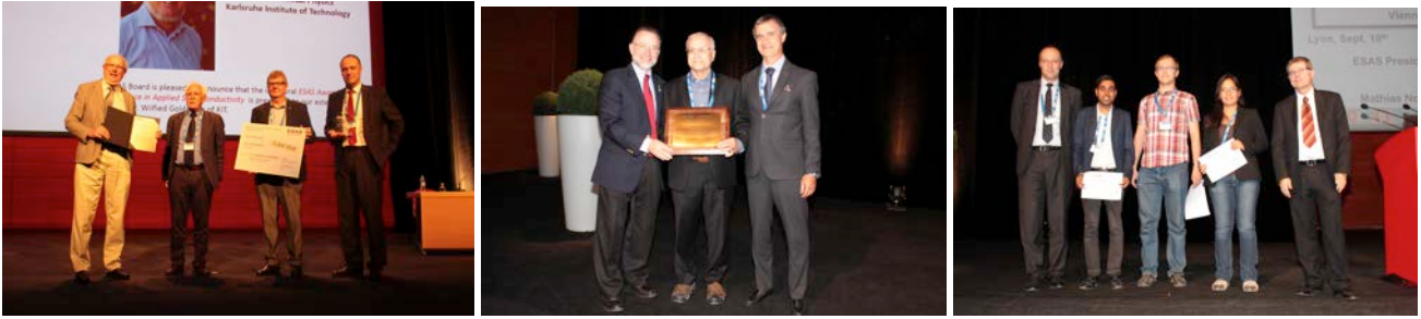
Award ceremonies during EUCAS 2015

From left to right: the ESAS Award ( PA29 ), IEEE Award ( PA31 ) and ESAS Young Researcher Prize ( PA30 ).