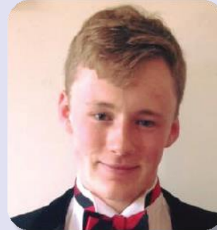
Ben Stoddard-Stones Quasiparticle injection